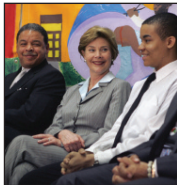
Mrs. Bush with Chicago Public School officials and a student at the Austin Community Academy High School at the grant announcement

announced 160 new schools that would receive a total of over $770,000 this year. Three other Chicago Public School grantees and officials from the Chicago Public School system were present for the event which was widely covered by local media.